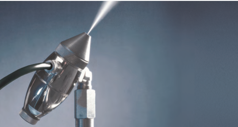
Direct room spray humidifier